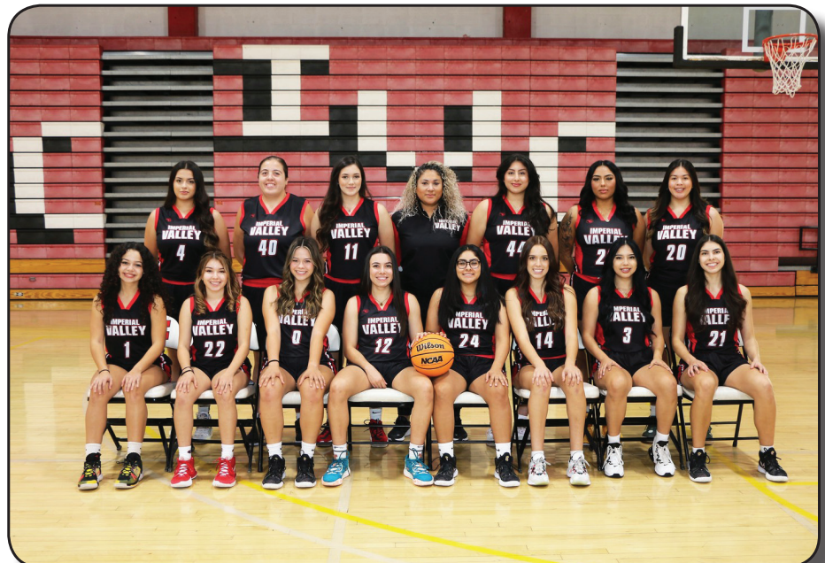
Women's Basketball Against College of the Desert