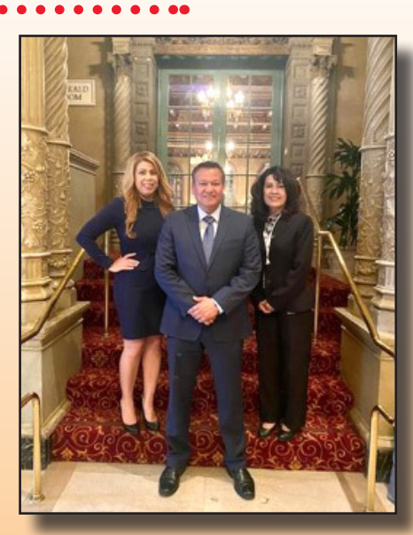
U.S. Census Latino Summit February 18, 2020