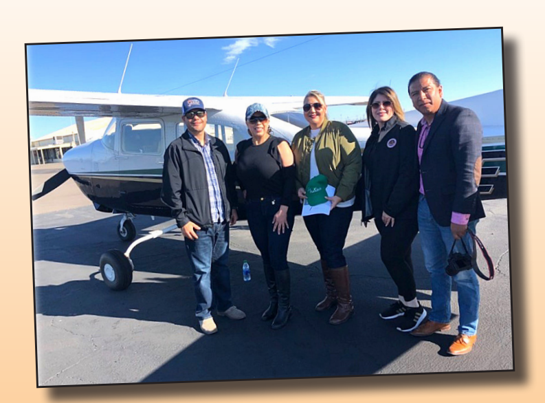
Flyover Salton Sea on February 14, 2020