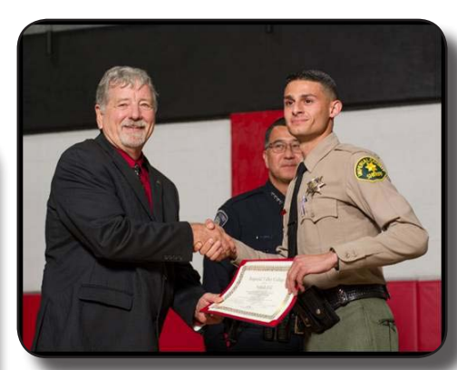
Post Level I