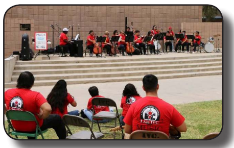
Iron Man & the Little Mermaid