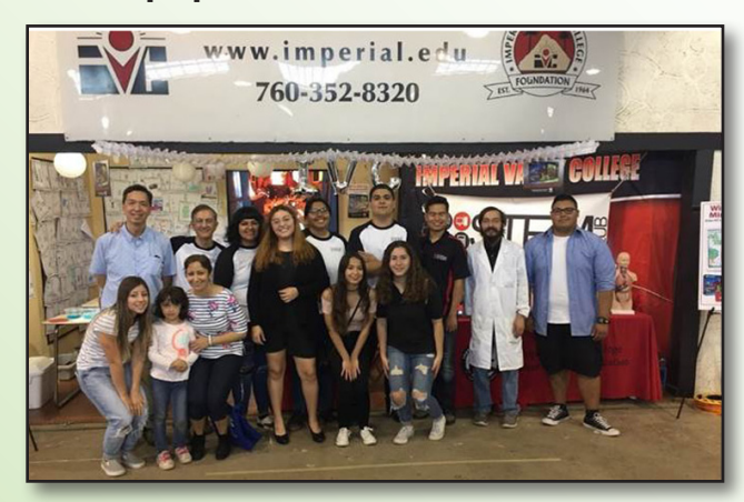
The STEM Club & Chemistry Club conducted experiments with cabbage, slides, dry ice, and more.

The new Diesel Club showcased diesel equipment.