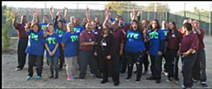
INSIDE/OUT COLLEGE PROGRAM