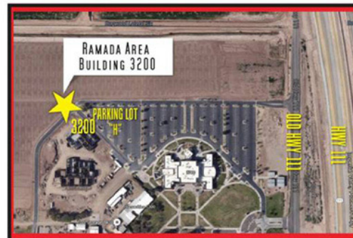
PARKING LOT "H" - RAMADA AREA OF BUILDING 3200

RSVP by Friday, Aug. 5th to marketing@zglobal.biz