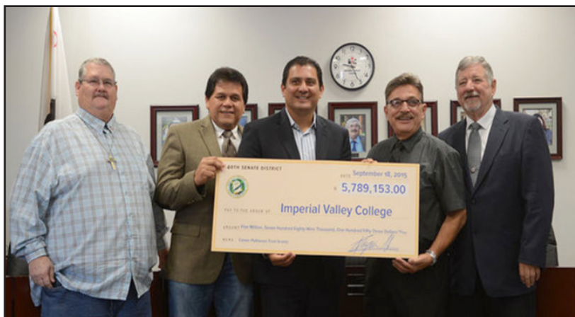
Sunday, September 20, 2015, Imperial Valley Press

Senator Hueso visited IVC on Friday, September 18, 2015, to present a check to IVC in celebration of the $5.8 million Career Pathways Trust Grant.