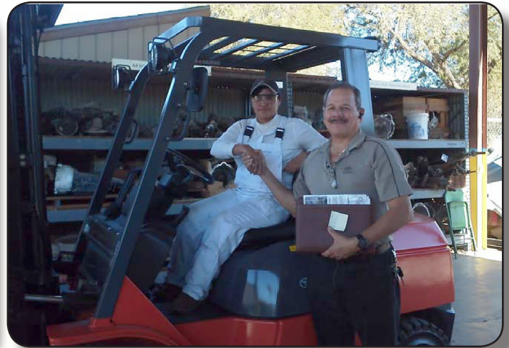
Forklift leased for CTE