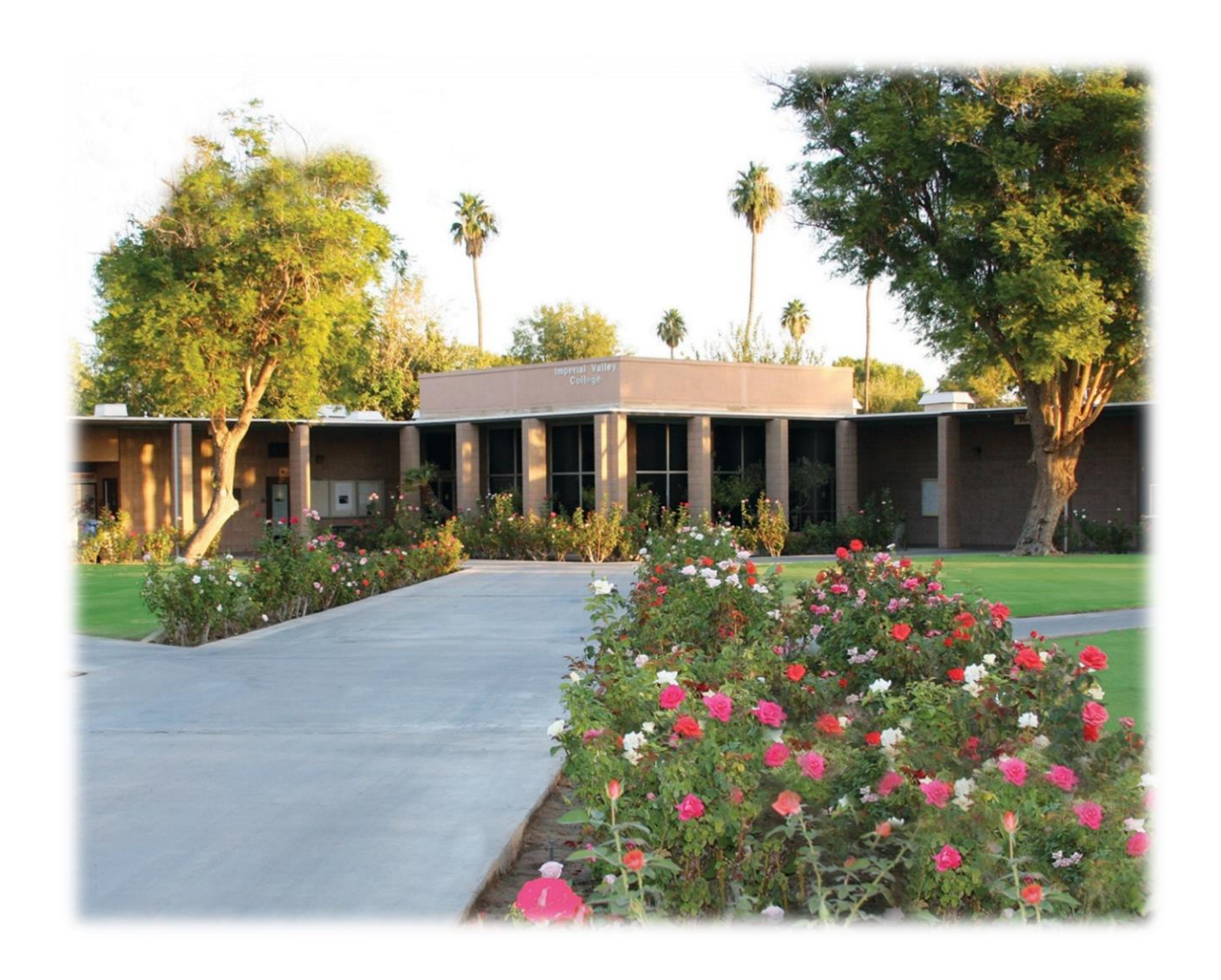
End of 2022