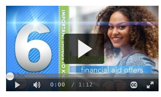
When will I receive my financial aid funds?