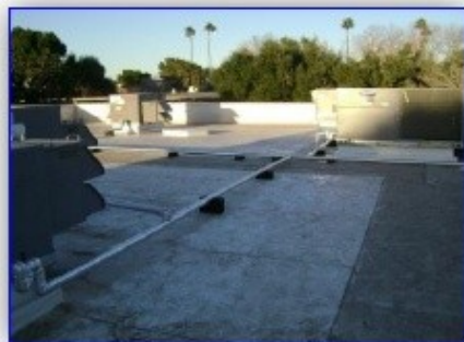
Roof Mounted Equipment