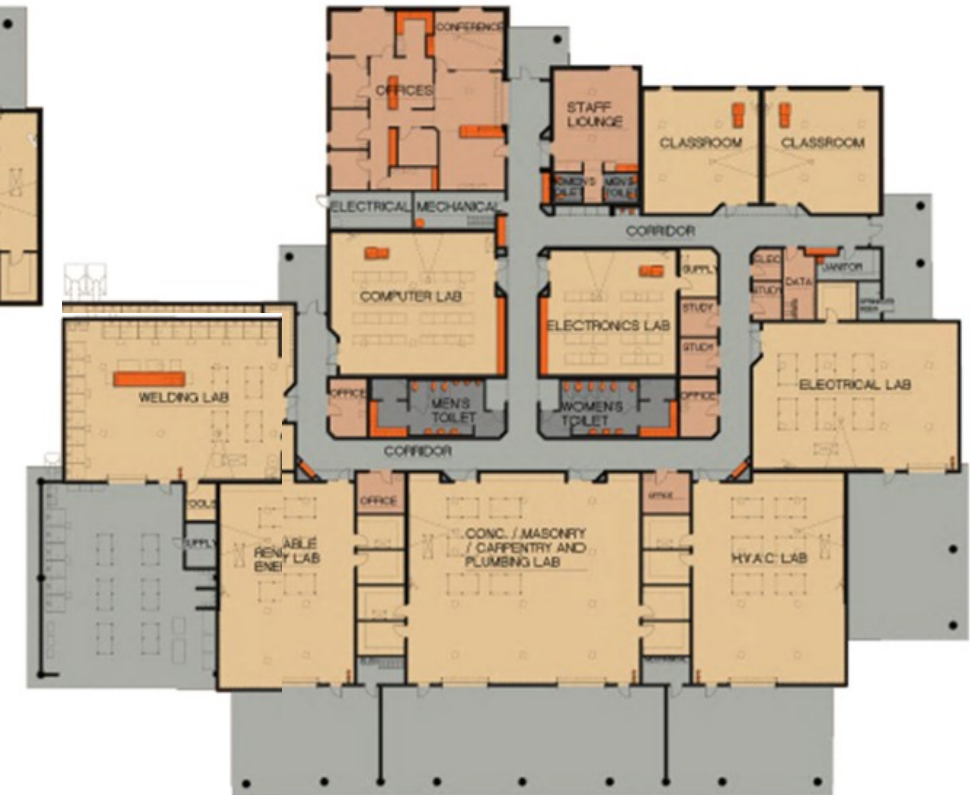
Building 3200 Floor Plan

Upcoming Site Work: includes the mechanical equipment and piping installation, asphalt paving of the road, and sleeves for irrigation under concrete.