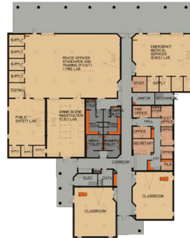
Building 3100 Floor Plan