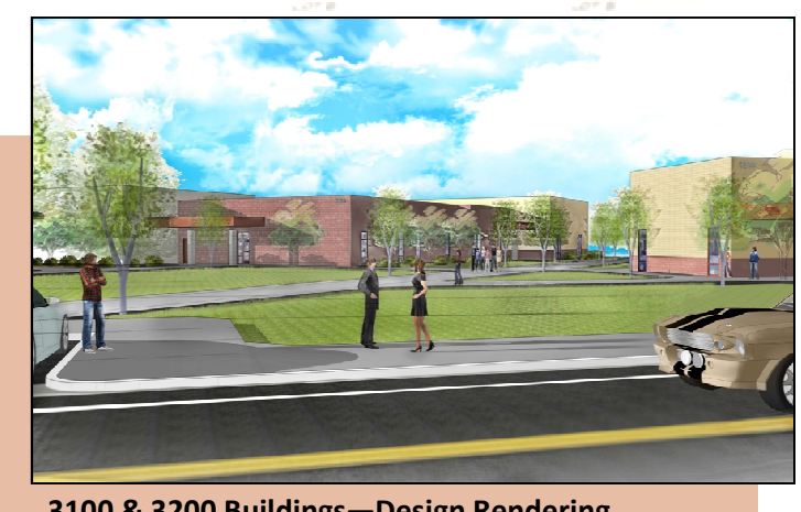
3100 & 3200 Buildings—Design Rendering