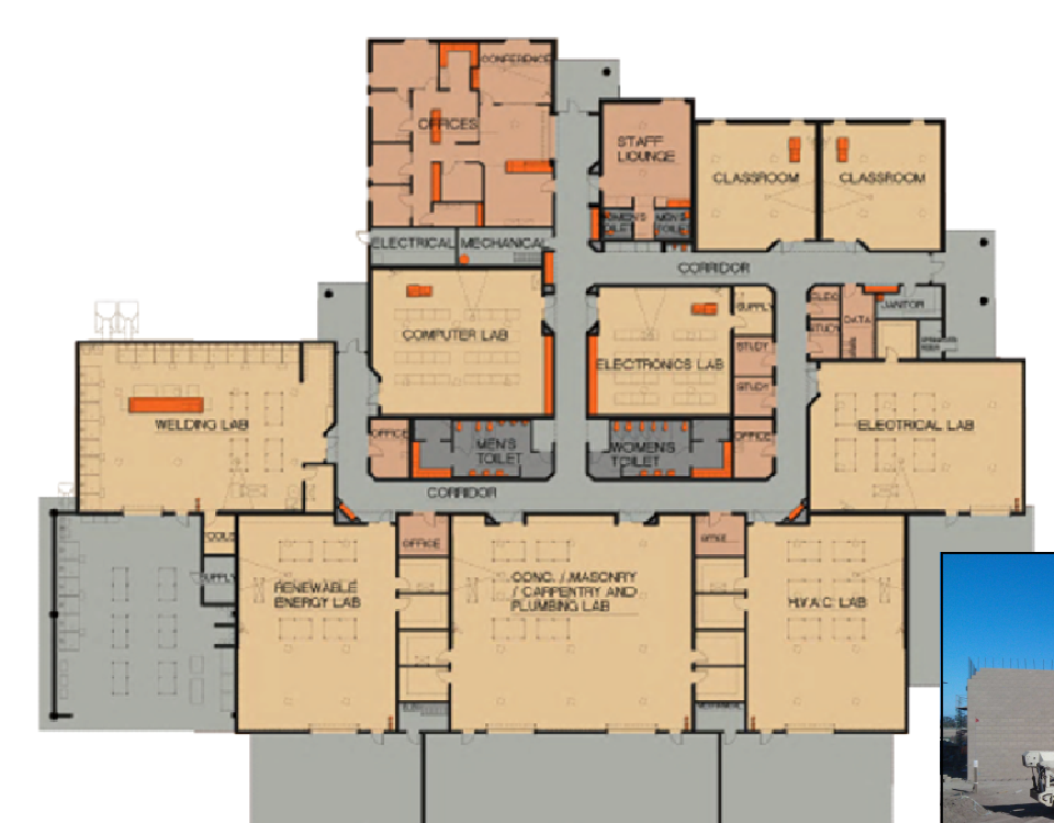
Building 3200 Floor Plan