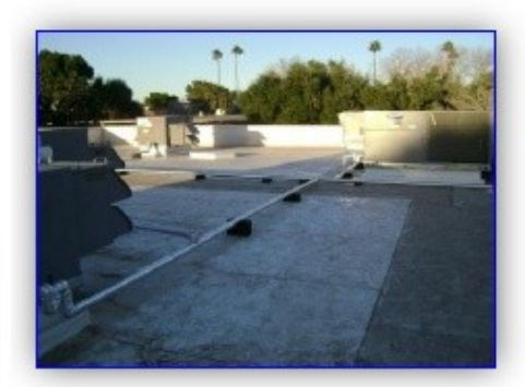
Roof Mounted Equipment