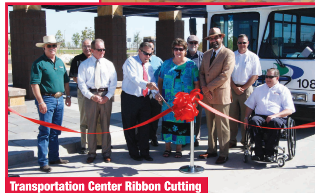
Transportation Center Ribbon Cutting