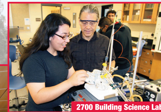
2700 Building Science Lab