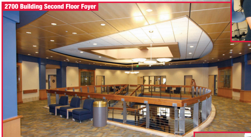
2700 Building Second Floor Foyer

The demand for higher education in Imperial Valley remains very high. Enrollment at IVC is skyrocketing as local students seek access to jobs that pay well, improve the local economy, and provide a better life for their families. We need to maintain our investment in the College and expand the opportunities for our community into the future.