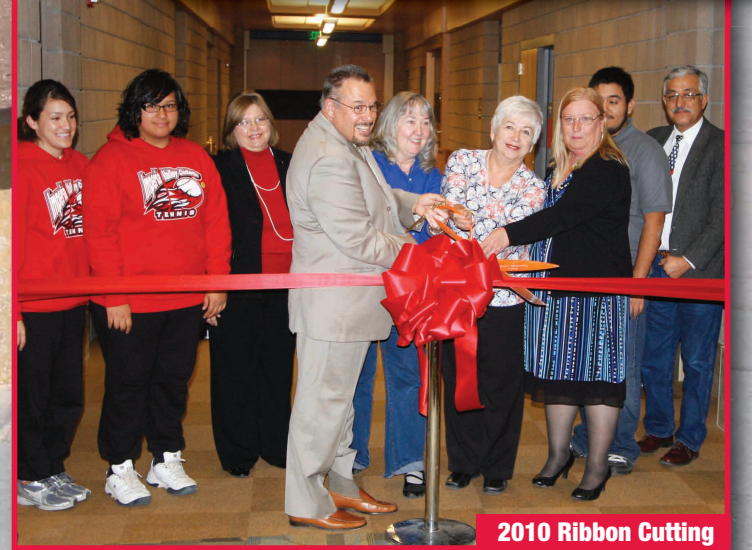
2010 Ribbon Cutting